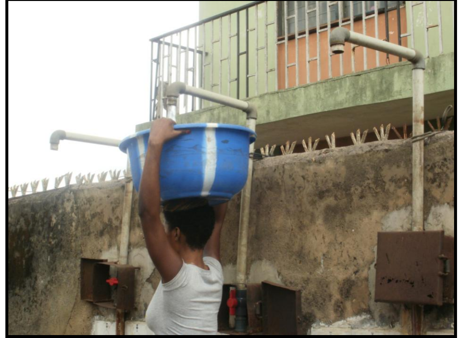
Figure 2. Individual Fetching water with an open container at a commercial borehole stand-post

bathing, cleaning, washing and other general use but without drinking. Most residents buy the popularly called "pure water sachet" for their consumption while some are indifferent, with the mindset that the water they drink would not kill them. Most house types are the long informal type of building popularly called "face to face" with an average of 10 rooms and five (5) household members in each.