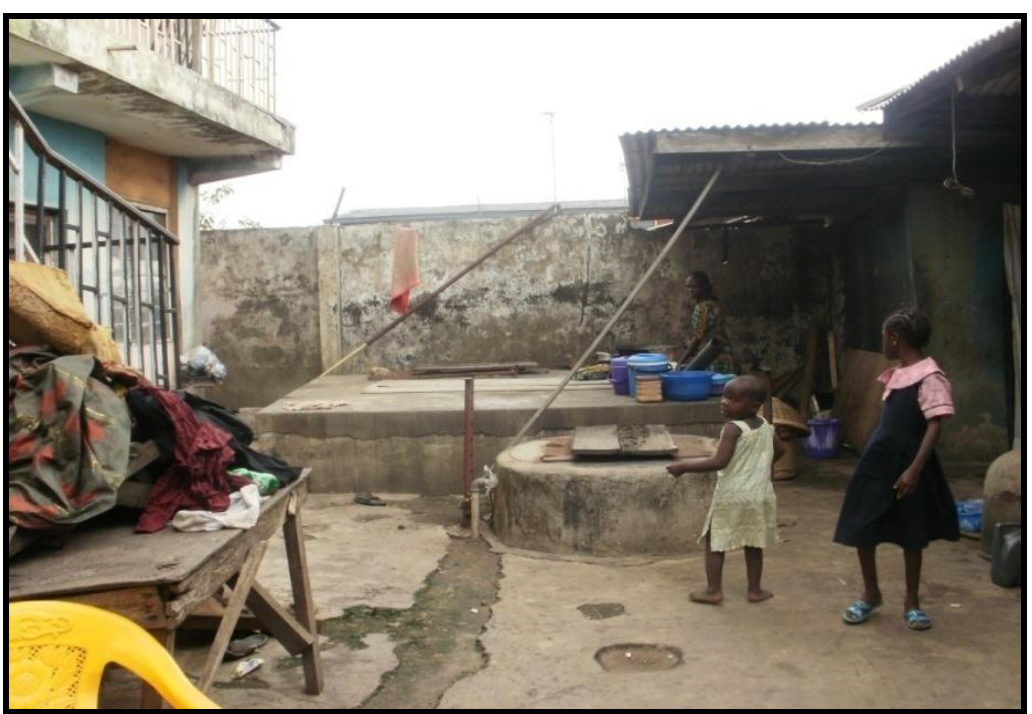
Figure 3. A household having water source close to the septic tank